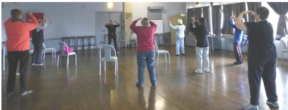
Tai Chi classes are proving very popular with participants