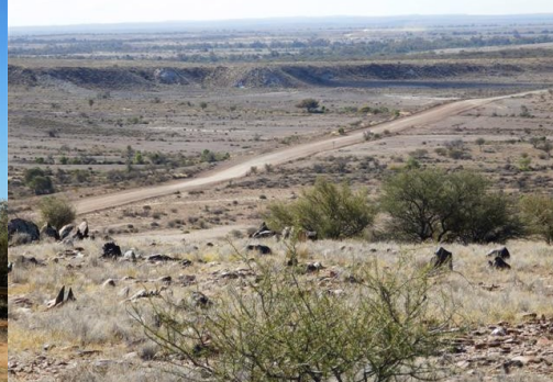
Tibooburra